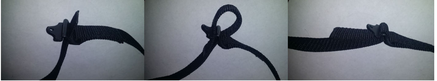
1: Insert Strap from bottom of buckle through the back slot (away from tab)