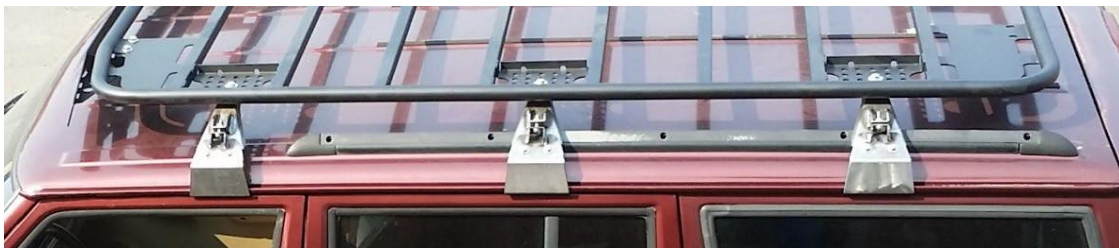
(Jeep Cherokee shown above for illustration purposes)